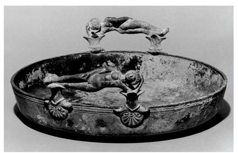
Figure 3.1 Serving Vessel with Handles in the Form of Figures, Attributed as 4th century BCE. Hellenistic; Italy. Copper alloy, 4.7/8 \times 14 \times 14 inches (12.4 \times 35.6 \times 35.6 \times 35.6 \text{ cm}) . The Menil Collection, Houston.