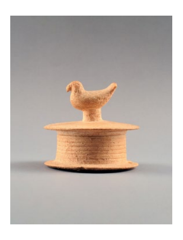
Figure 3.3 Container (Pyxis) with Dove, 2700–2300 BCE. Early Cycladic II; Greece, Cyclades Islands. Marble, 3\ 1/8 \times 3\ 3/8 \times 3\ 3/8 inches (7.9 × 8.6 × 8.6 cm). The Menil Collection, Houston.

One of the earlier purchases of the de Menils is a diminutive marble container (pyxis) with a sculpted dove (Figure 3.3). It is an ecru color and is approximately 3" in diameter and 3" high. It could have been made as an individual item for cosmetics or created as a funerary object. The small size makes it personal and easy to hold. The container had been identified both as "provenance unknown" and "reputedly found on