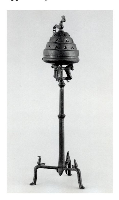
Figure 3.4 Incense Burner, 6th–4th century BCE. Achaemenid Period; Iran. Copper alloy, 14\ 1/2 \times 11\ 3/8 \times 4\ 3/8 inches (36.8 \times 28.9 \times 11.1\ cm) . The Menil Collection, Houston.

The emotional engagement of collecting can make some buyers – even the highly-educated de Menils – want to believe a piece is authentic. An example is the bronze Achaemenian style incense burner (Figure 3.4) sold to the de Menils in 1973. Although the structure is possibly composed of real artifacts, fully assembled it becomes an Achaemenian Frankenstein. Its flamboyant design and hodgepodge nature of assembly lead experts to believe that it is fake (Muscarella 71). Again, students of history miss the opportunity to learn about what part of this pastiche is original.