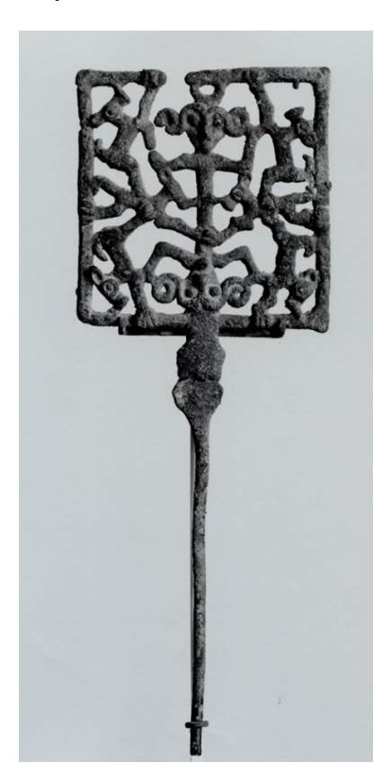
Figure 3.5 Standard or Pin Depicting Figures and Animals, 10th-7th century BCE. Iron Age; Iran. Copper alloy, 7\ 1/8 \times 2\ 3/4 \times 1\ 1/8 inches (18.1 \times 7 \times 2.9\ cm) . The Menil Collection, Houston, Gift of J.J. Klejman.

When referring to object biography, researchers often give objects familial attributes such as orphans. The comparison is apt; for if you do not know from whence you came, how can you begin to identify yourself. The types of questions that could be answered by knowing the findspot are numerous. An orphaned item is a singular object which has no record of the place where it was found. The pin stands approximately 7 inches high, with an open framework design that is 2 3/4 by 1 1/8 inches. It is made of a copper alloy. Knowing the findspot could allow historians to discern how far this votive pin traveled from its production site through metallurgical analysis. Location of the find may indicate the social circumstances of its use.