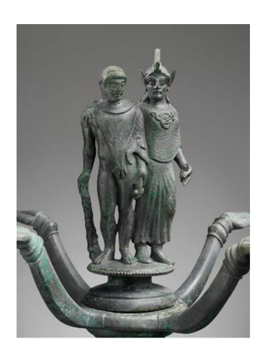
Figure 3.2 Candelabrum, Etruscan, Classical, ca. 500-475 BCE, Object 61.11.3 (Metropolitan Museum of Art US).