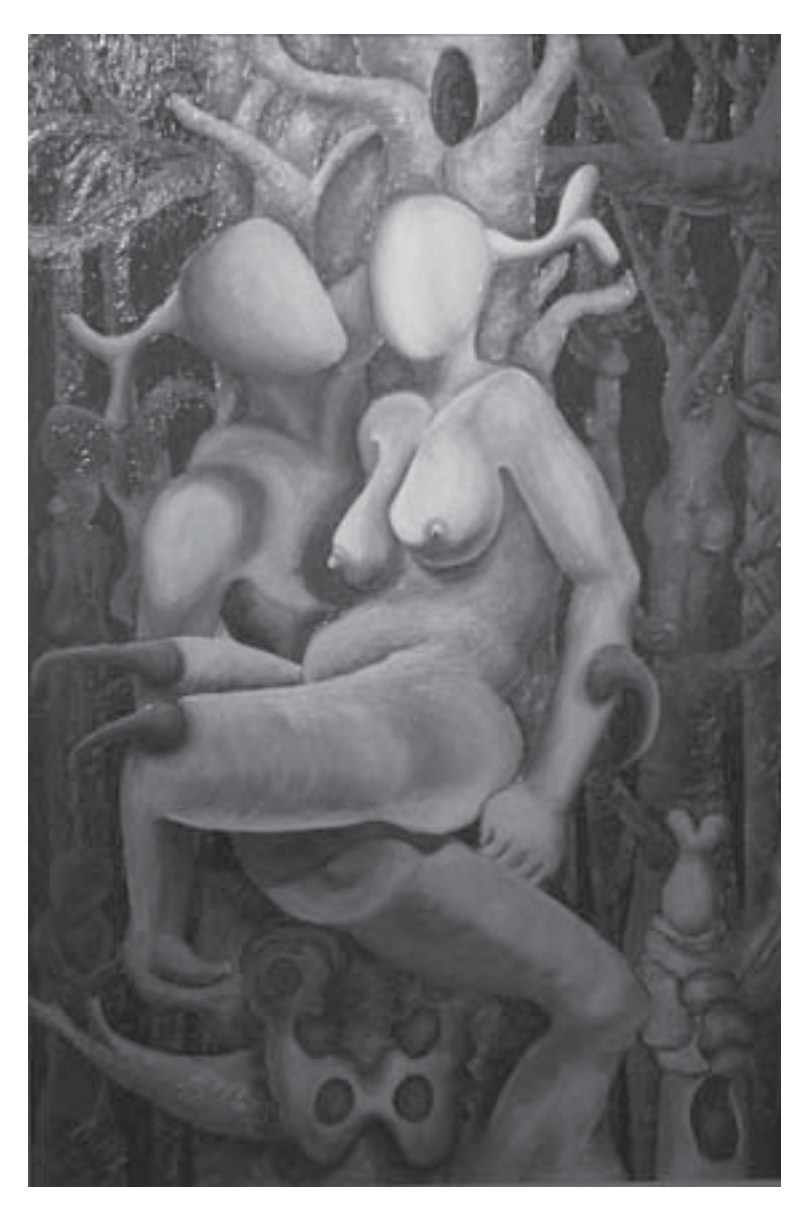
Sumbul Jain Calculated Love oil