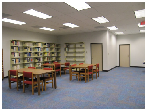
Archives reading room, November 2012

The exact date, when firm, will be announced on the library homepage.