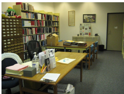
Archives reading room, March 2012

The UHCL Archives will reopen to the public following the Thanksgiving break.