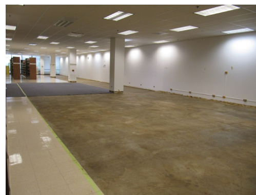
Pre-construction footprint for a second storage vault, April 2012