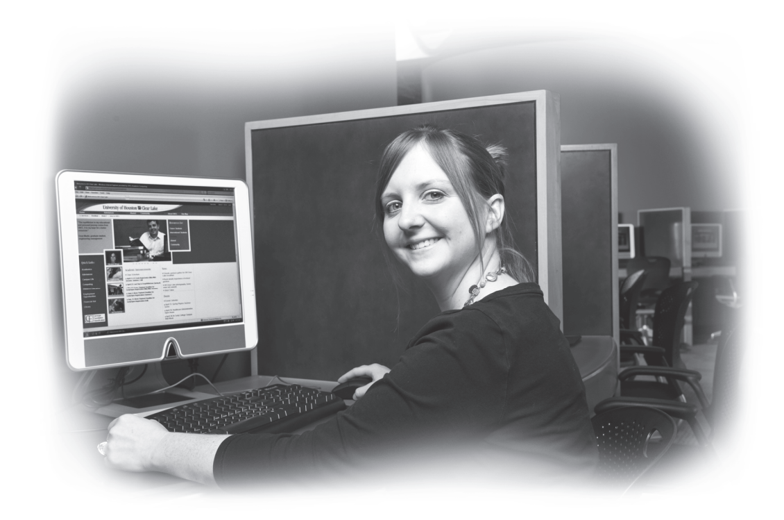
Students can find all the information they need for success at UHCL by visiting www.uhcl.edu.