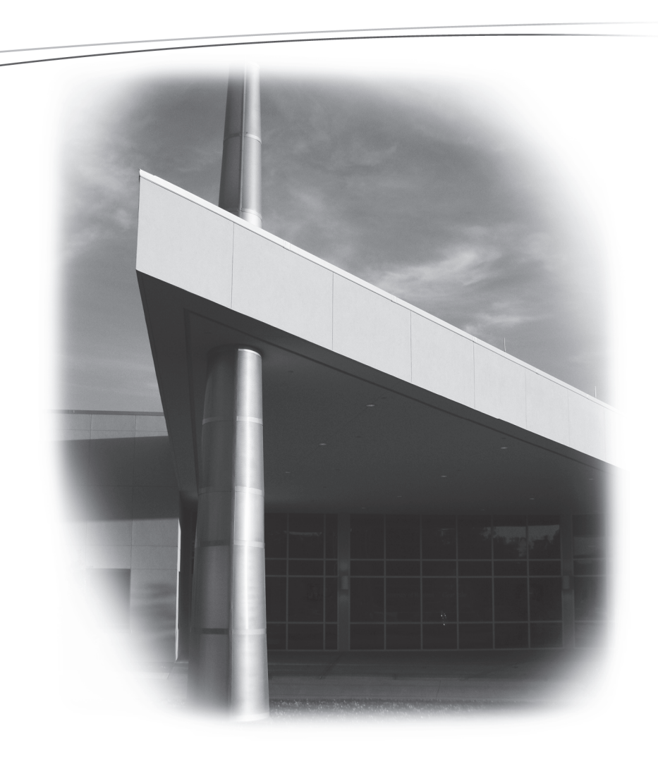
UHCL Pearland Campus opened in fall 2010, offering convenience and opportunity to Pearland-area residents. Students can complete junior, senior and graduate coursework in high-demand disciplines such as business, education and psychology.