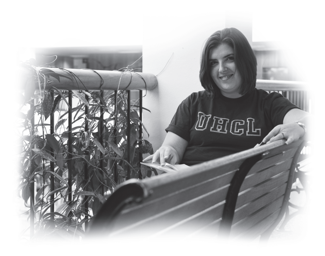
Whether indoors or outdoors, students find the environment at UHCL ideal for individual or group study.