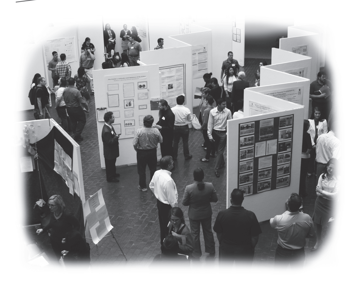
UHCL's annual Student Conference on Research and Creative Arts showcases student research projects in a professional forum, enhances classroom experiences by facilitating interaction across disciplines and strengthens the role of education in the professional community.