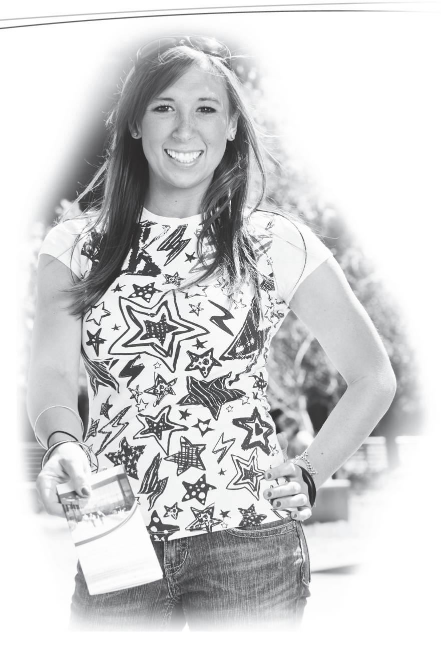
At UHCL, there is a friendly face around every corner. UHCL's Student Assistance Center, housed in the Student Services and Classroom Building, is staffed with friendly, knowledgeable people ready to assist students.