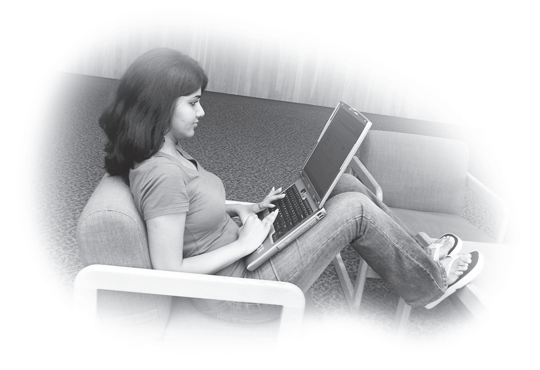
Students applying for financial aid can complete the process entirely online.