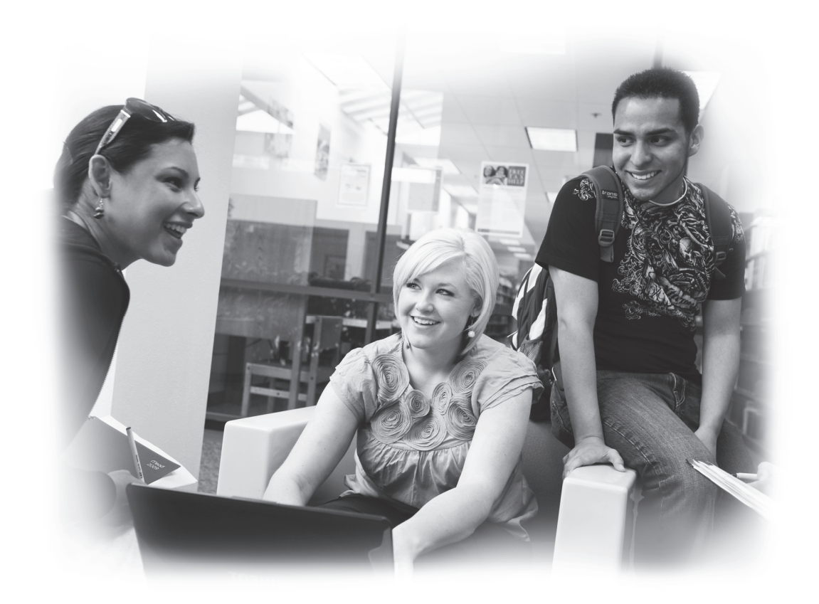
Logging in to E-Services is easy and convenient. Students have the ability to check their financial aid award at any time, even during a quick break during a study session.