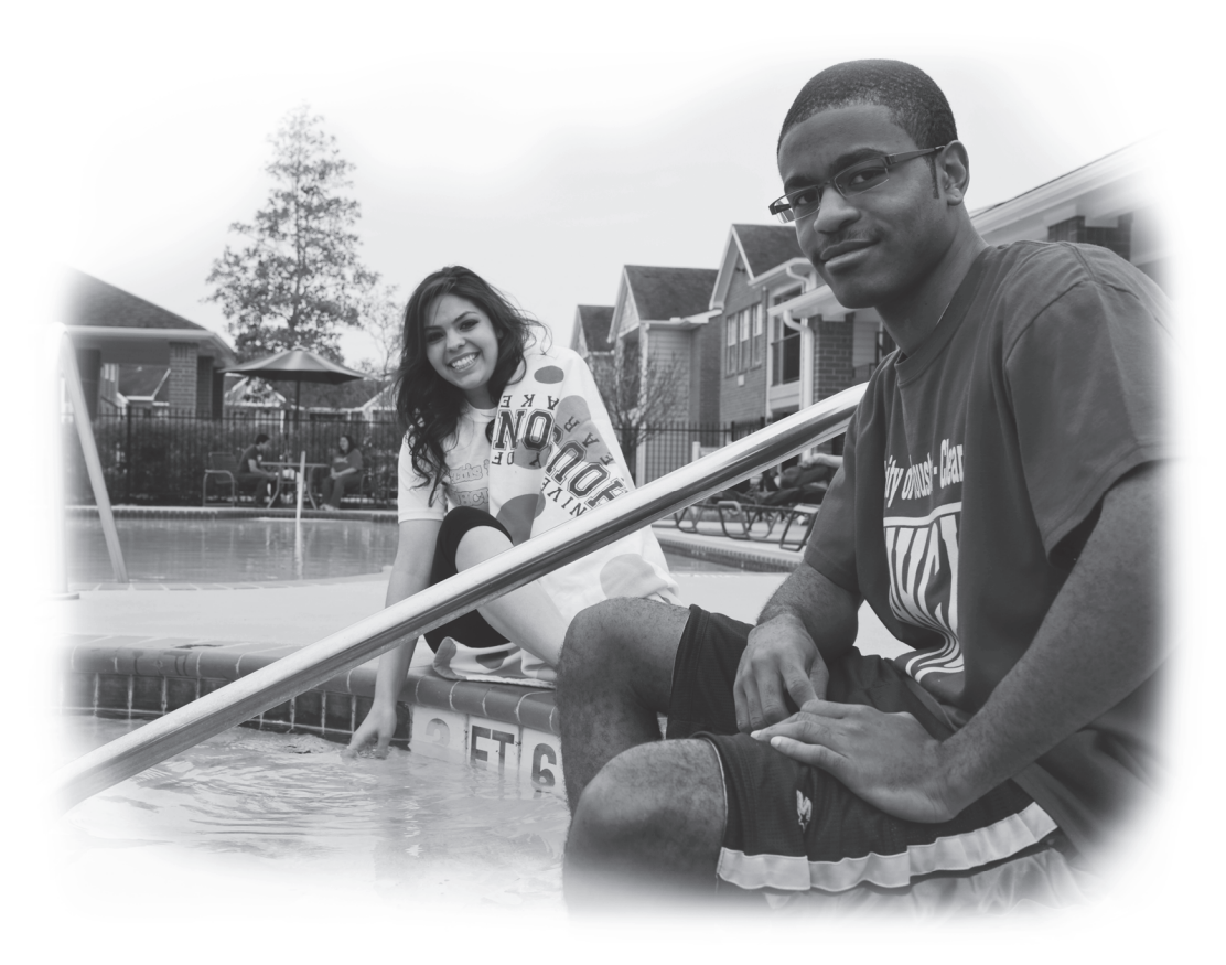
Students relax by the pool and hot tub at University Forest apartments, located on the UHCL campus.