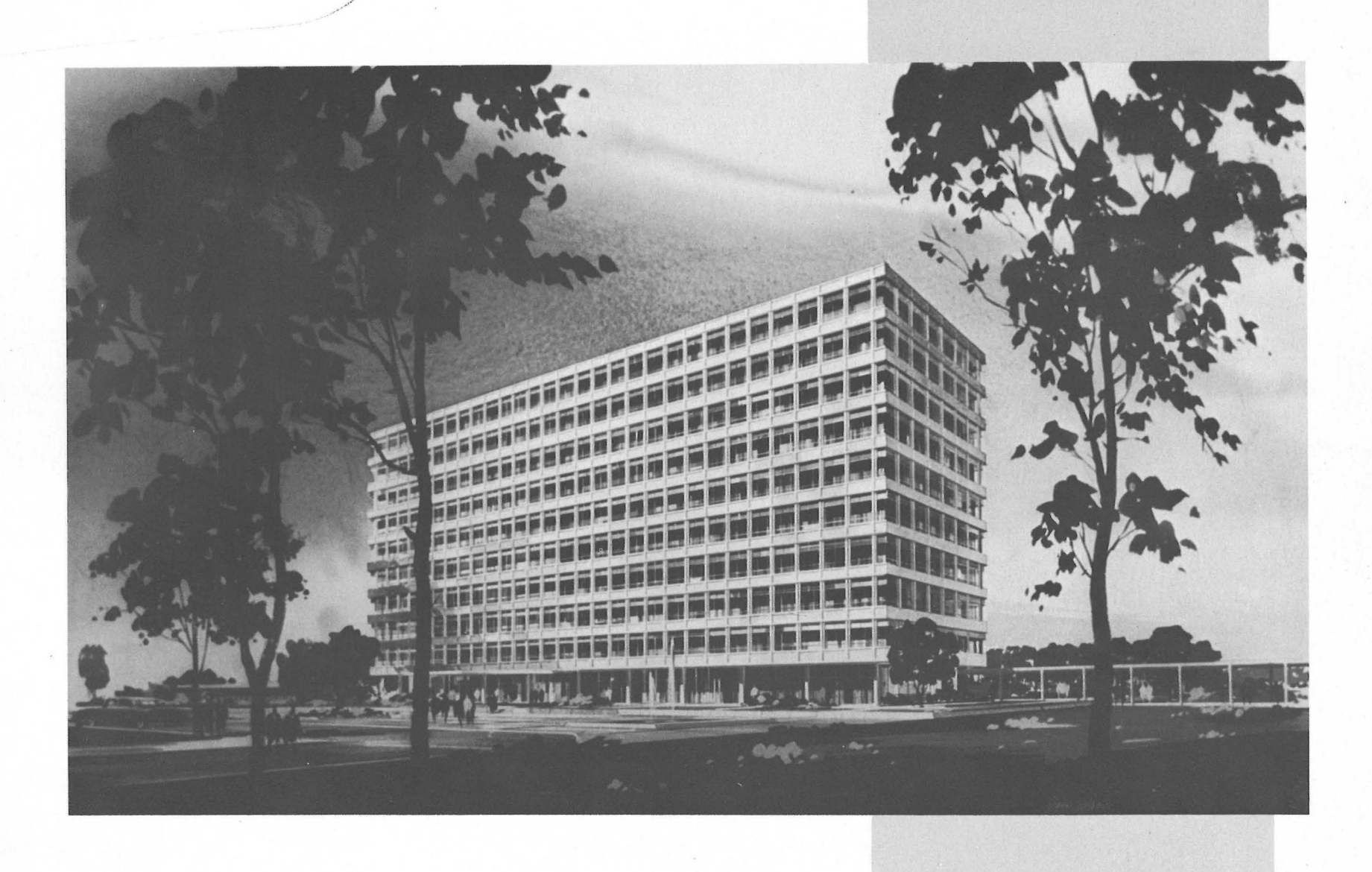
CLEAR LAKE—SITE NO. 1 (EVENTUAL HOME OF MANNED SPACECRAFT CENTER)