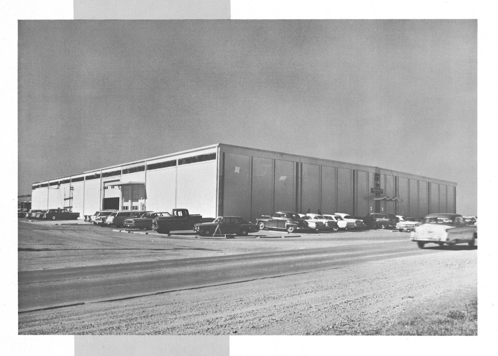
RICH BUILDING—SITE NO. 3 SPACECRAFT RESEARCH DIVISION—SYSTEMS EVALUATION AND DEVELOPMENT DIVISION 6040 TELEPHONE ROAD