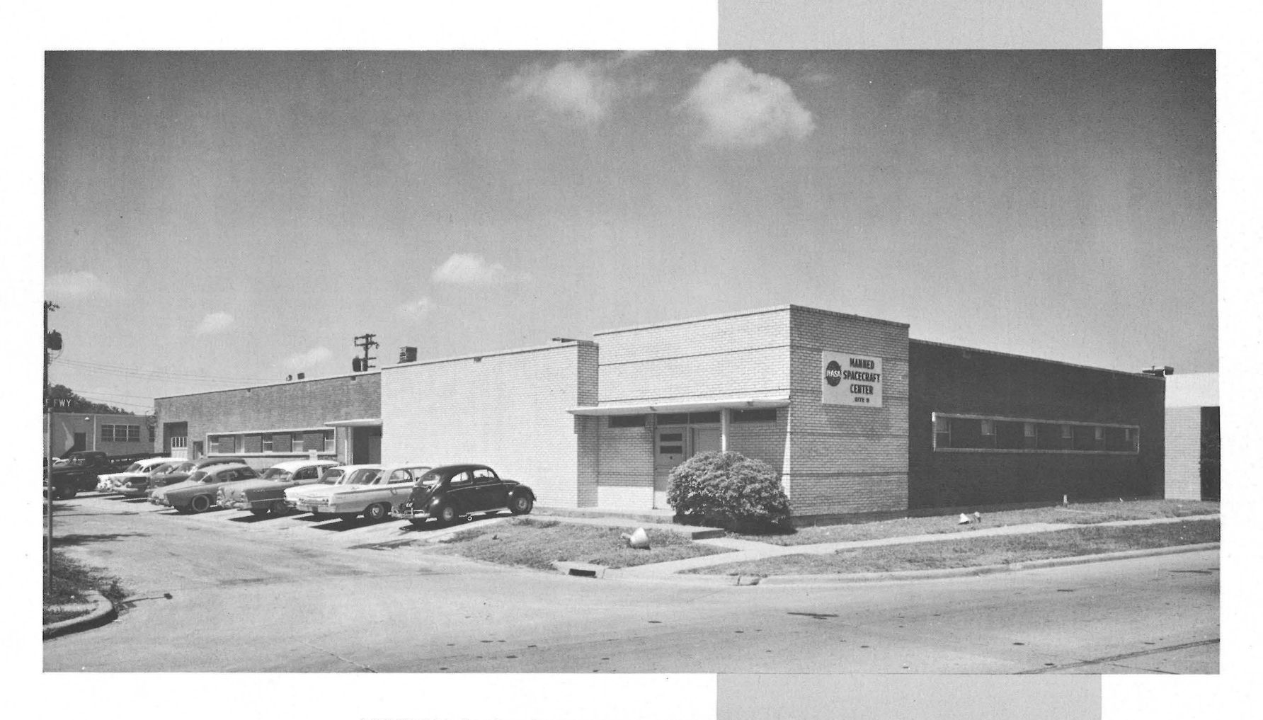
MINNEAPOLIS-HONEYWELL BUILDING — SITE NO. 9 PUBLIC AFFAIRS OFFICE OFF FREEWAY (OUTBOUND) AT EXIT 4