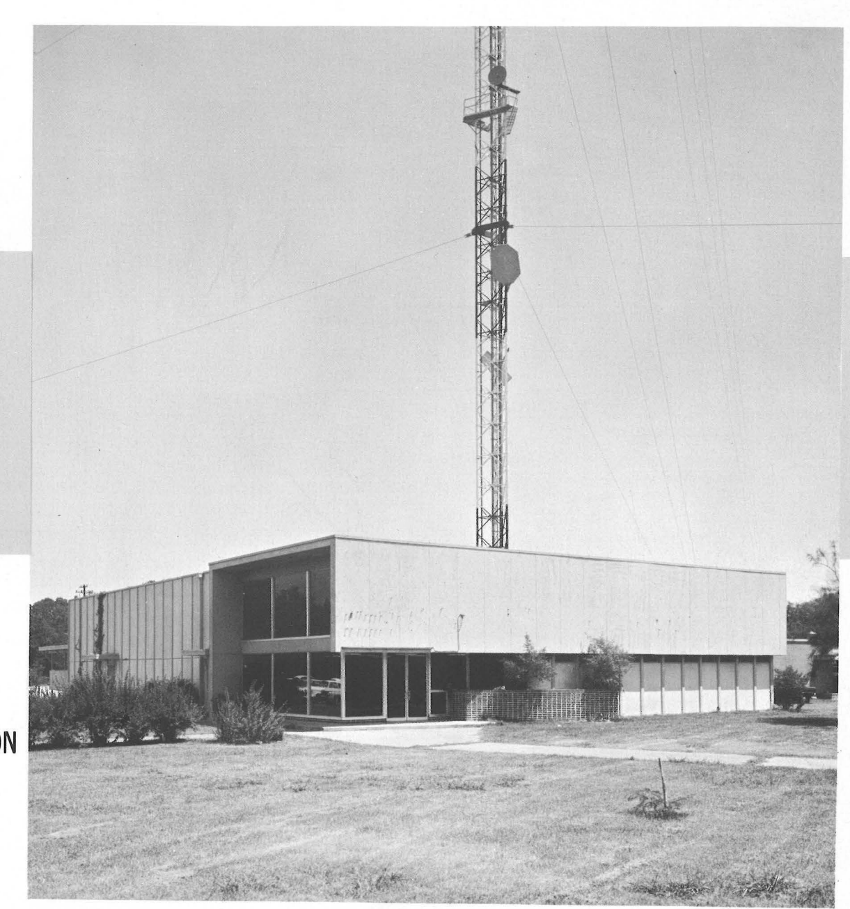
KHOU-TV BUILDING — SITE NO. 11 DATA COMPUTATION AND REDUCTION DIVISION CULLEN BOULEVARD